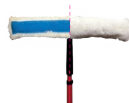
Shiny Brush SB4

For proper application of the product even in hard to reach areas, a microfiber brush mounted on a telescopic arm which projects up to 4 m is available.