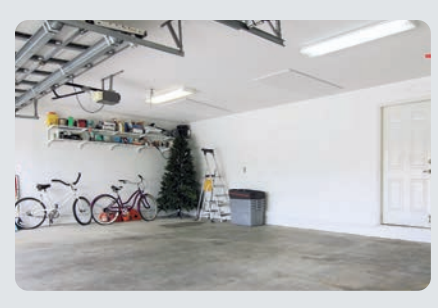
WAREHOUSES - GARAGES